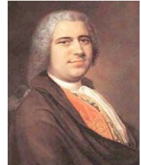
J.A. Hasse (1699-1783)